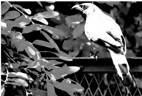
Rufous Treepie Dendrocitta vagabunda One is never far away from a treepie's call here; like other corvids, it is very adaptable, omnivorous and an opportunistic feeder.